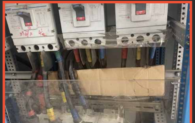
Combustible material inside electrical panel